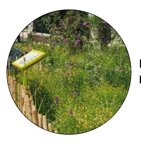
Increasing biodiversity through planting